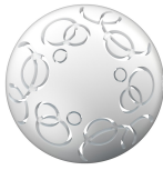
DCT Easy Fresh Air Freshener