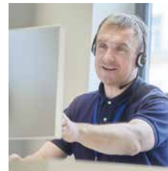
24/7 training by phone