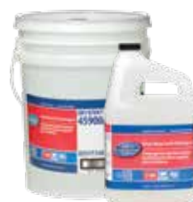
Metal safe solutions