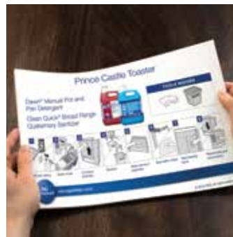
Simplified procedure materials, wall charts and job aids